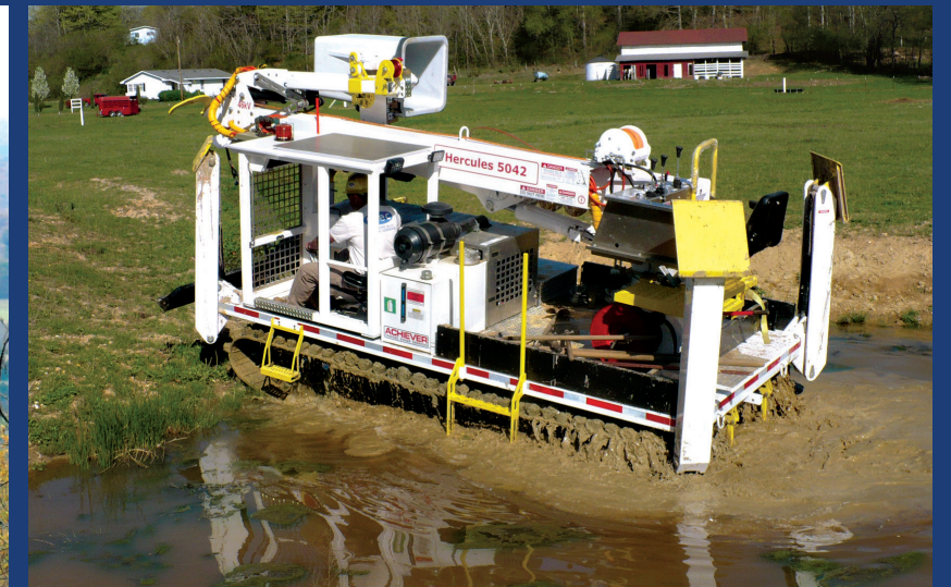
Low ground pressure means excellent flotation on soft ground