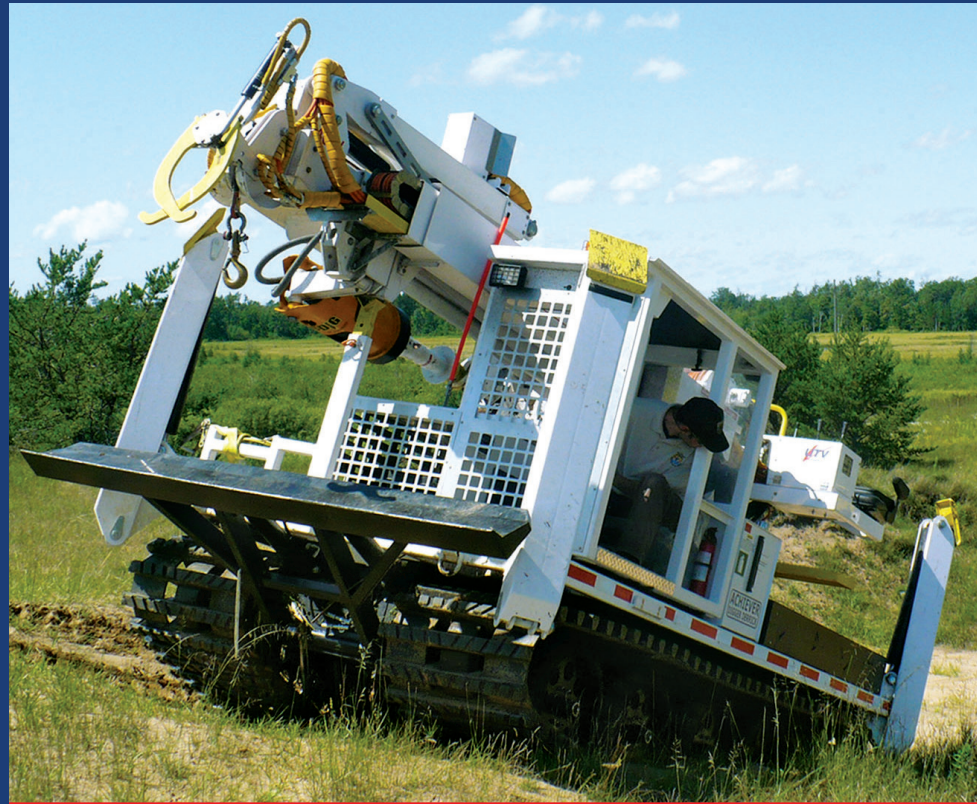
The only derrick on the market that can climb a 40 degree slope with a low center of gravity to provide excellent sideslope stability