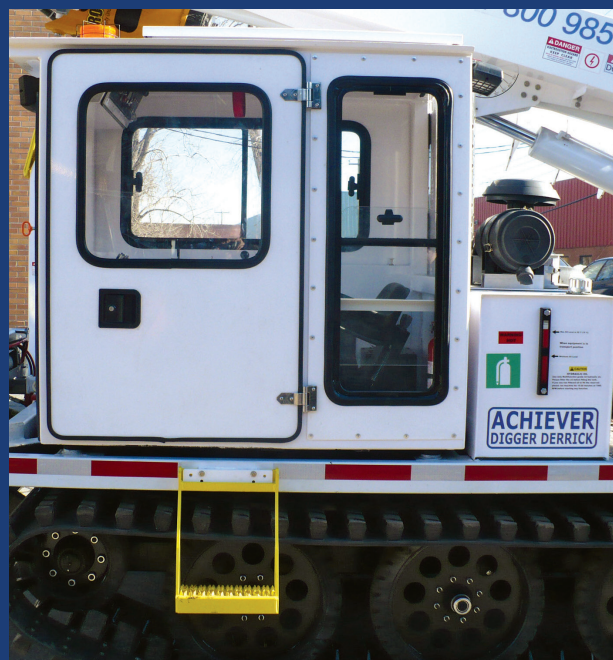
The optional closed cab comes with a front wiper, heater and two opening windows