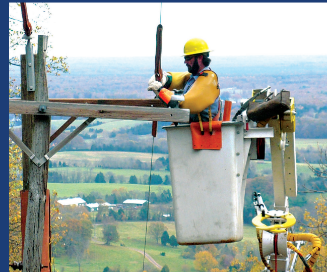
The insulated bucket has a 47' reach and comes with full pressure controls and an optional tool outlet and jib