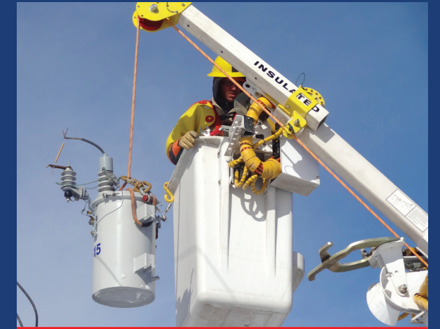
The optional material handling jib can lift up to 600 lbs