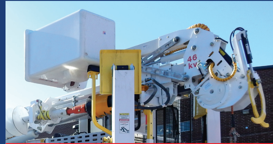
6,000 lb boom tip winch On fiberglass 3 rd boom, Insulated