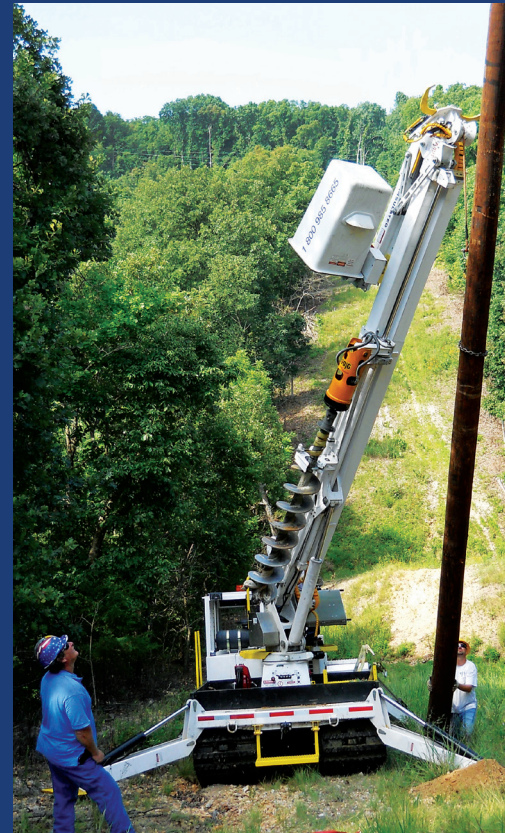
The Achiever can set up to 70' poles