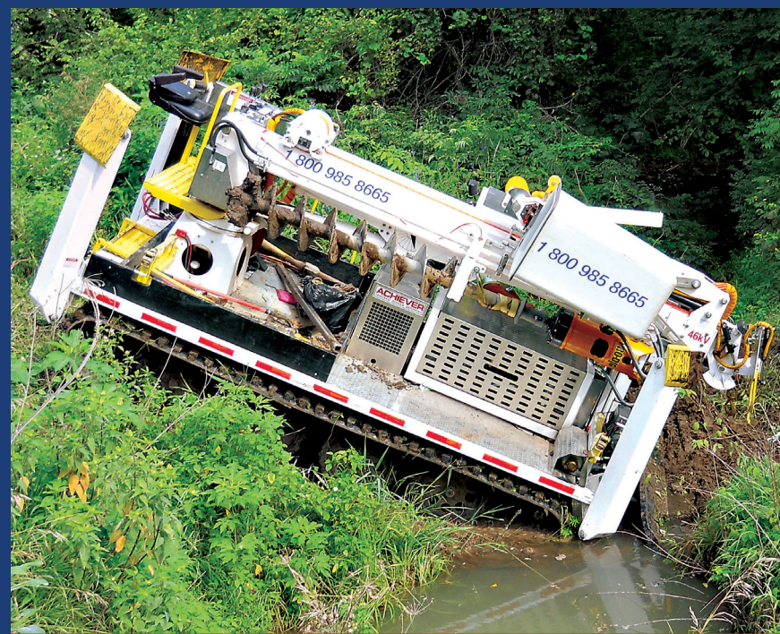
The Achiever's advanced track and suspension design and powerful engine allow it to go almost anywhere