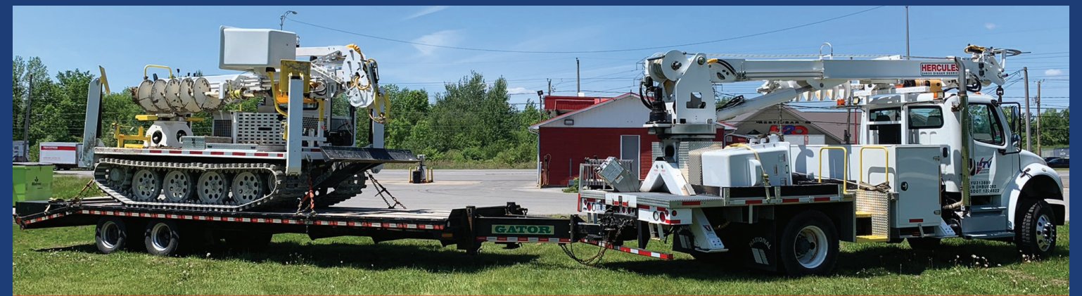
RT-02 DD Tracked Digger Derrick is easily transportable to jobsite on a dual axle trailer behind a single axle bucket truck