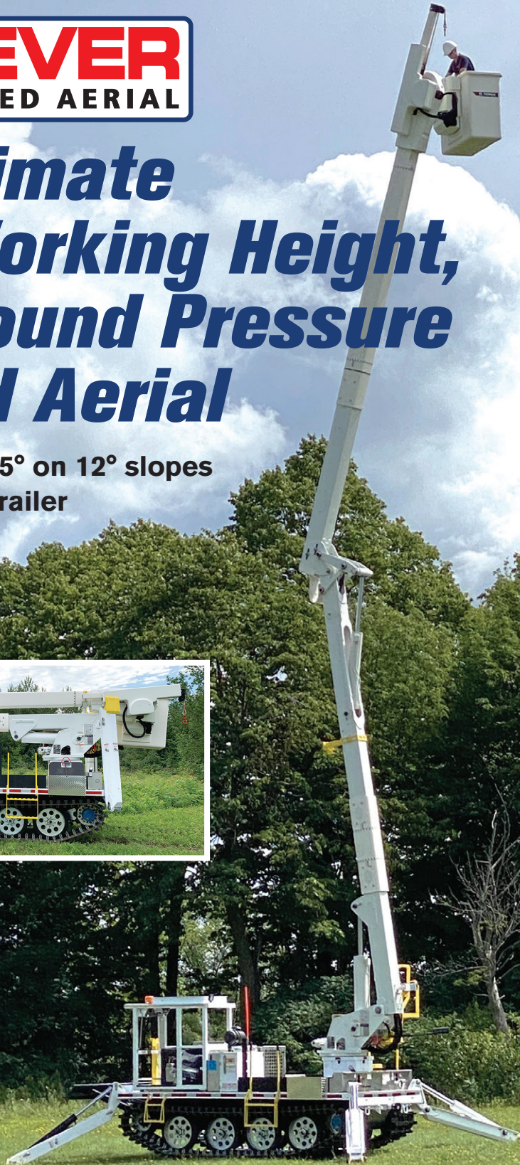
UTV Achiever Carrier with a Terex Optima TC-55 High Ranger